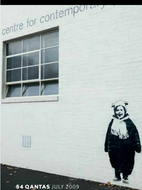
Wall of fame (clockwise from below): outside the Centre for Contemporary Photography; inside the State Library of Victoria; just hanging at the CCP's Kodak Salon

This white-cub of a building is far from ordinary. Don't come here expecting well-mannered photographs; CCP is a platform for cutting-edge "photo-based" arts embracing anything from lightboxes and video to elaborate installations. Local talent features alongside international names such as US performance artist Miranda July (earlier this year). Popular shows include the annual Kodak Salon in April and May – Australia's largest open-entry photographic competition and exhibition – and a biannual display from the Documentary Photography Award finalists from August to September. Enthusiasts will find Chinese-made Lomo cameras in the on-site bookshop. 🌐